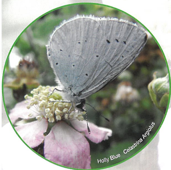
Holly Blue Celastrina argiolus

Guernsey's beautiful landscape is defined by its distinctive roadside hedge banks which form an important part of our Island's heritage. They form living threads which run through and connect the parishes, and can be a haven for both plants and animals, adding much to the Island's natural living diversity.