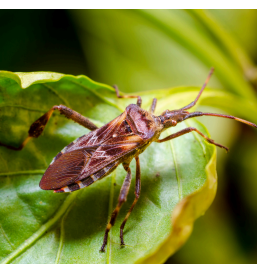
Western Conifer Seed Bug

Large with white zig-zag across centre. Dark brown diamond at rear. Flattened hind legs 20mm